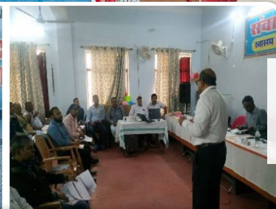
Orienting District and Block Level Officials on Operational Aspects of HBYC Program in District Jamui