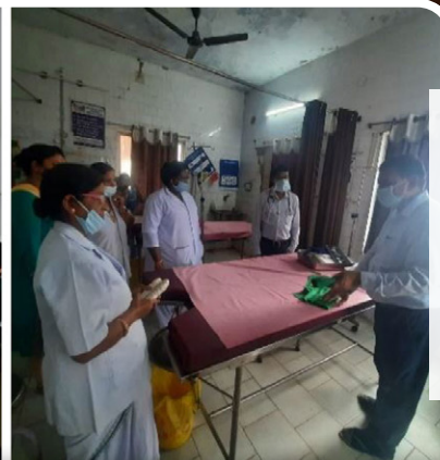
Supporting National Newborn Care Week: Mentoring visit along with NHM Officials to SNCU, NBSU & labour rooms of District Dhenkanal