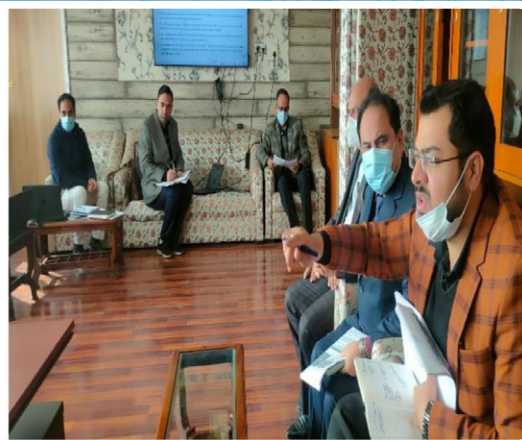
Improving Maternal Health Services: NIPI Supported NHM and DHS J&K in Conducting Situational Analysis of Maternal Health Services, Dissemination Meeting Held in Chairmanship of Additional Chief Secretary and MD NHM