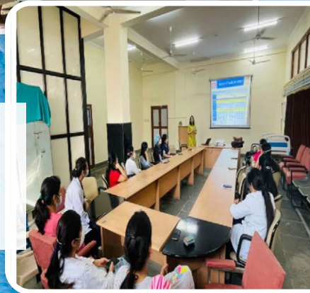
Improving Quality of Care Through LaQshya Program: Training of Health Staff on LaQshya Program at Government Medical College SMGSH Jammu