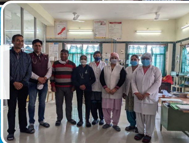
NIPI conducting FPC assessment in district Churu