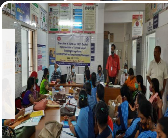
Evidence Building for demonstrating innovative approach for Cervical Cancer Screening in Odisha: Training of Health Staff Held in Cuttack