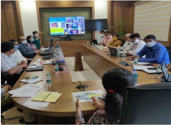
Presenting data analytics in State level review meeting on COVID-19 Chaired by MD NHM and supported by NIPI