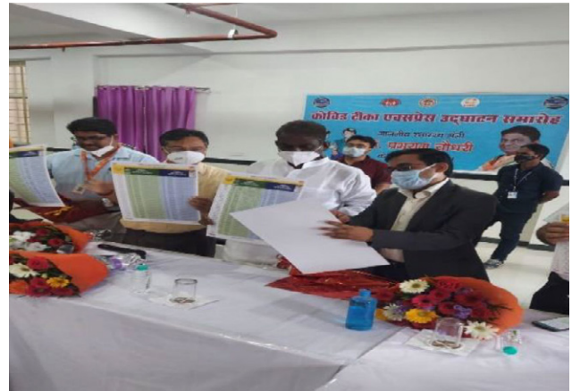
Launching COVID-19 Calendar by Health Minister developed by NIPI