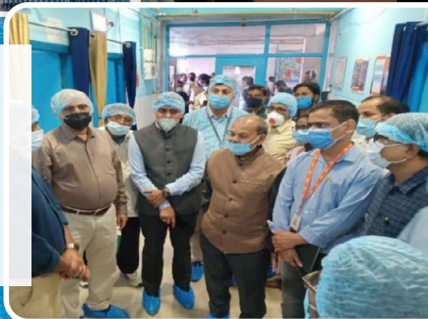
Participating in Common Review Mission (CRM) of Government of India: NIPI team visited district Lakhisarai along with MD NHM to monitor of preparations for CRM