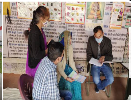
Monitoring of SNCU Baran during National Newborn week