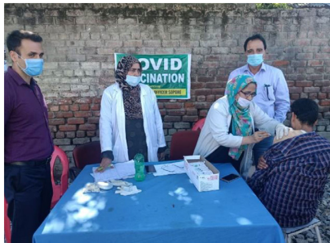
COVID-19 vaccination monitoring along with NHM team in District Baramulla