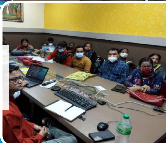
Virtual orientation of CHOs in District Mayurbhanj