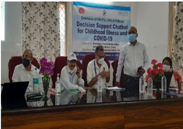
Digital Support System to Fight with COVID-19: Orienting Health Workers on Decision Support Chatbot for Pediatric COVID Case Management Developed by NIPi