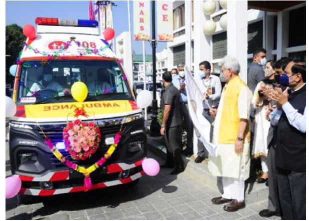
NIPI supporting felicitation ceremony of COVID-19 Warriors. Flagging of 34 New ALS Ambulances and Launch of 108 Sahayakdoot Application by Honorable LG of J&K Sh. Manoj Sinha