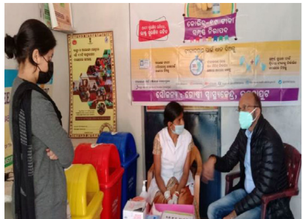
Monitoring COVID-19 vaccination site in Block Lamtaput District Koraput