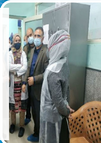
Improving Quality of Care in Aspirational Districts: Assessment of Preparations in Government Medical College Baramulla for LaQshya Certification