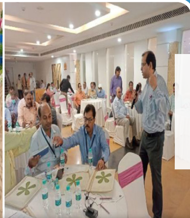
Strengthening First Referral Units: NIPI supported training of newly notified FRU representatives