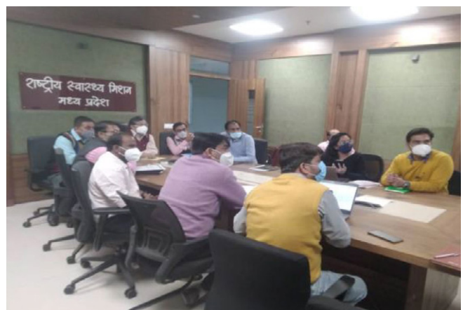
Participating in COVID-19 and Routine Immunization review meeting