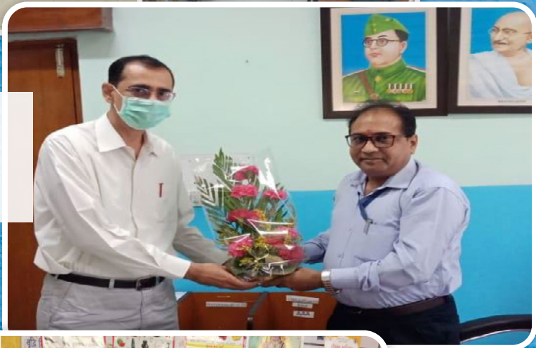
NIPI Rajasthan team welcoming New Director RCH