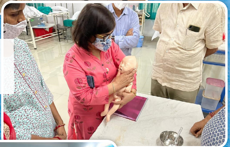
Ensuring evidence based high impact innovations for care of small and sick newborns: NIPI facilitated State Level Training of Trainers on FPC at NMCH Patna