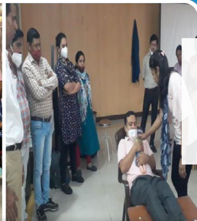
NIPI supported Training on Family Participatory Care at RNT Medical College Udaipur