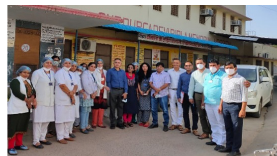
National LaQshya Assessment of CHC Chirawa, Jhunjhunu

“NIPI Team is supporting National Health Mission (NHM), Rajasthan to maintain continuity of key activities under LaQshya during the COVID-19 pandemic by organizing mock drills on virtual assessments of labour rooms and maternal OTs at the participating facilities.”