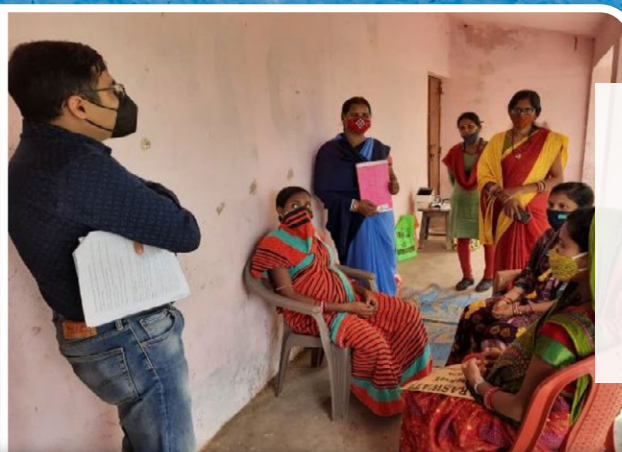
Interacting with CMHO, DPM, BDM, DDM, ANM & mothers during HMIS study in District Mayurbhanj and Bolangir