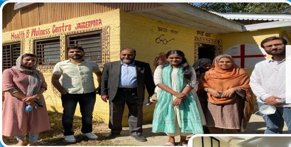
Monitoring Health Facilities and Schools along with NITI Aayog team in Aspirational District Kupwara